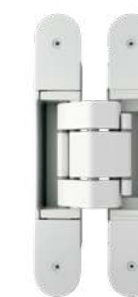
IN310190P03 White Matt RAL 9016