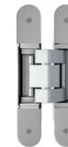
IN310190V703 Satinized Silver Plated