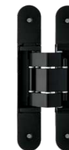
IN310190N03 Matt Black Plastified