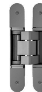
IN310190VN03 Satinized Nickel Plated