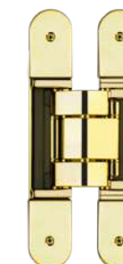
IN310190VO03 Polished Gold

OTHER KIND OF FINISHING AVAILABLE ON REQUEST