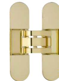
Hinge IN303120VO02 Caps GC300010J005 Polished Gold