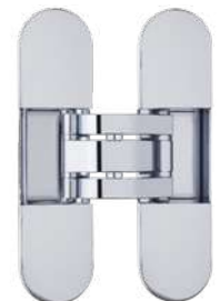
Hinge IN303120VD02 Caps GC300010VD02 Polished Chrome

OTHER KIND OF FINISHING AVAILABLE ON REQUEST