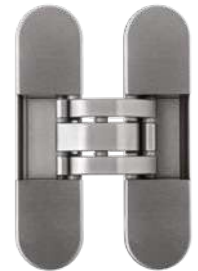
Hinge IN303120VN02 Caps GC300010J205 Satinized Nickel Plated