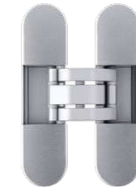
Hinge IN303120V702 Caps GC300010J102 Satinized Silver Plated